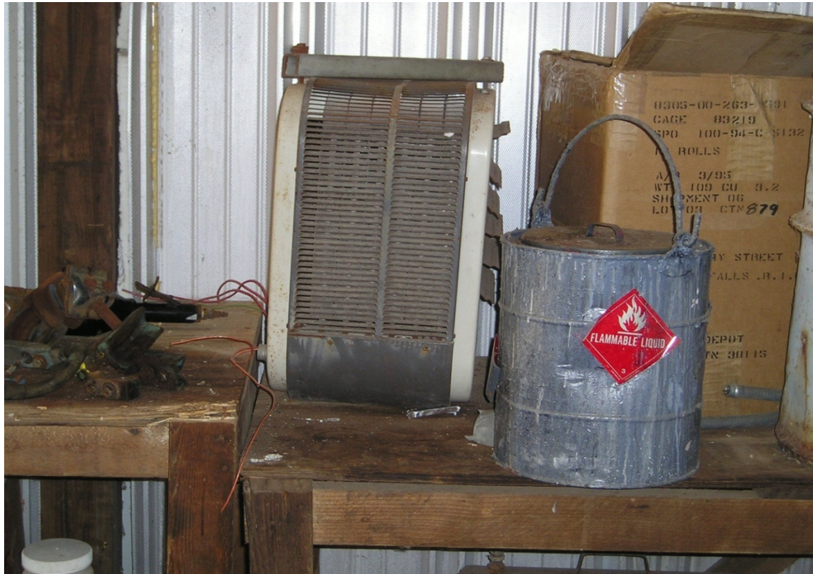
Space heater and flammables